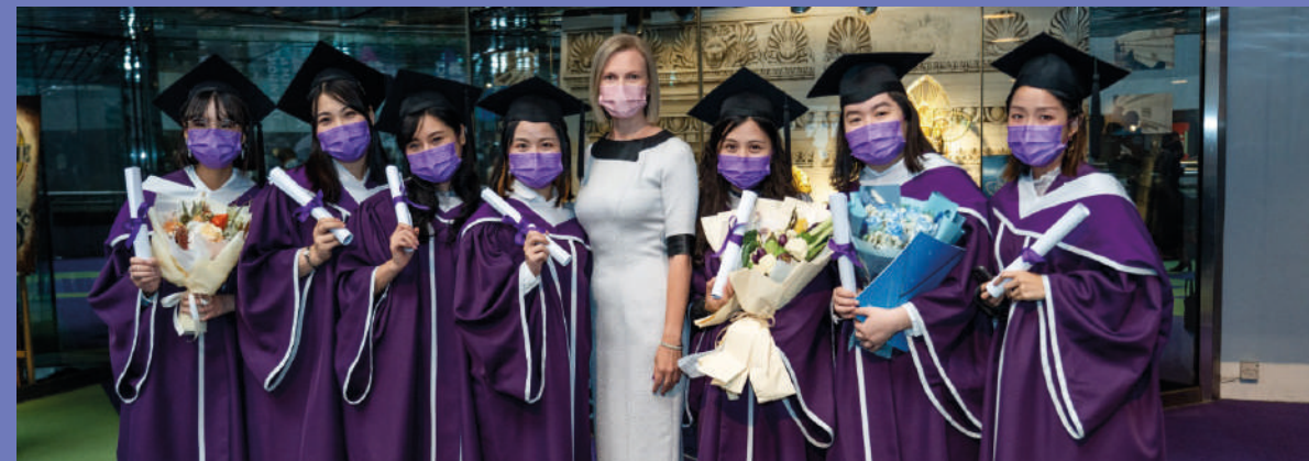
▲▲ Academy graduates sharing joyful moments. 演藝學院應屆畢業生共享喜悅時刻。