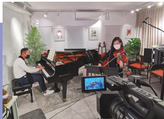
The white_ink_box programme was introduced during the pandemic to provide a performance venue for artists in different fields. 疫情期間與朋友開設「白墨盒」，為不同領域的藝術家提供表演場地。