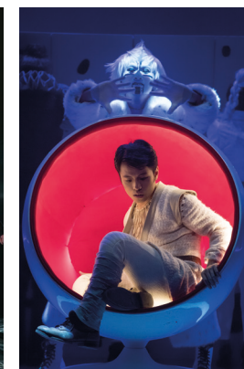
The School has staged a number of musicals over the years, including Spring Awakening (left) and Pippin (right). 學院曾上演多齣音樂劇，包括《青春的覺醒》(左)和《Pippin》(右)。

musicals to be created. We definitely see a future for our students. This art form is already very advanced in many parts of Asia, including Korea and Japan. Hong Kong needs to catch up if we want to jump on the musical bandwagon." ▲