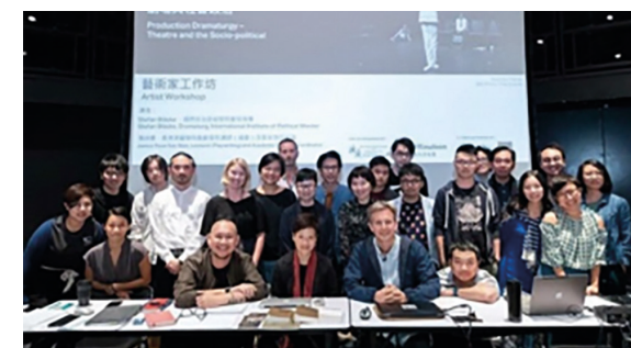
Workshop from the "Dramaturgy and Beyond" project. 「超越劇場構作」計劃的工作坊。