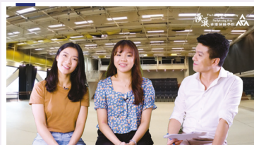
Dance students share campus life 舞蹈學生分享校園生活