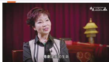
Cantonese opera maestro Wan Fai-yin MH talks about professional training 著名粵劇花旦尹飛燕MH談專業培訓