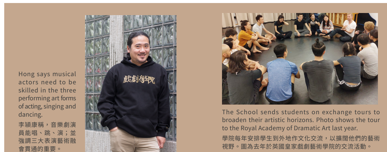
The School sends students on exchange tours to broaden their artistic horizons. Photo shows the tour to the Royal Academy of Dramatic Art last year.