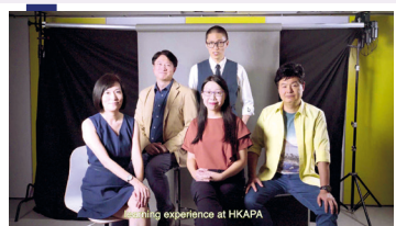
Lecturers introduce the importance of Complementary Studies 學院講師介紹輔助學科的重要性