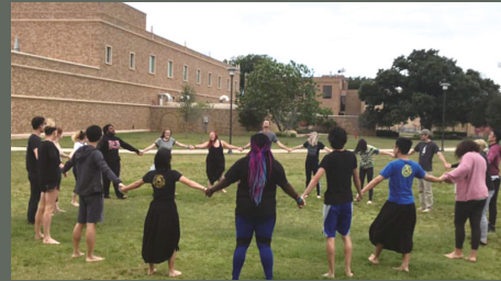
Students and staff went on a 4-week training course at Texas Tech University in June. 師生於6月中遠赴美國德州理工大學參加一連四週的訓練，與當地師生作交流。