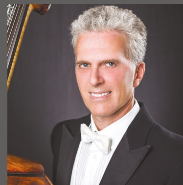
Principal Bass, New York Philharmonic Bass Department Chair, The Juilliard School