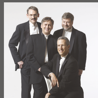
Timothy Eddy / Todd Phillips / Steven Tenenbom / Daniel Phillips