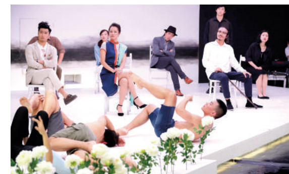
The Seagull , an Academy production in 2017, was awarded Scenography of the Year at IATC(HK) Awards and The Best Stage Aesthetics Design at the 10 th HK Theatre Libre. 2017年演藝製作節目《海鷗》分別於IATC(HK)劇評人獎及第十屆香港小劇場獎獲年度舞台科藝/美術獎和最佳舞台美學設計。