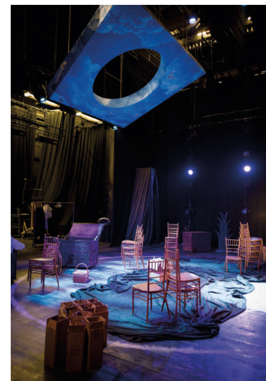
The set, lighting and sound of most of Academy productions are designed and produced by students of the School of Theatre and Entertainment Arts. (This photo shows the set of Academy opera 2019 The Magic Flute which was produced by Academy students.)

大部分演藝製作節目的佈景、燈光和音響，均由舞台及製作藝術學院學生設計和製作。(圖片為今年3月上演的演藝學院歌劇《魔笛》的佈景，由學生製作。)