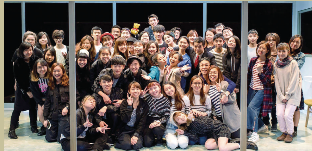
The full team of Luna Gale . 《兒欺》台前幕後大伙兒合照。

上學年的校內製作戲劇《兒欺》，於多個專業劇場頒獎禮勇奪多項獎項及提名，包括第28屆香港舞台劇獎年度優秀製作（右下圖）、第11屆香港小劇場獎最佳整體演出（左下圖）和最佳女主角等。學生製作獲業界認可，固然可喜可賀，但更重要是，學生可充分利用校內機會，於舞台上與不同學院的師生一起實踐所學，與公眾分享表演藝術。