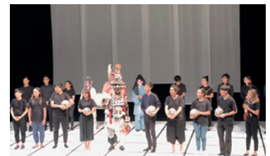
The Academy team thanking the audience after the performance On Harmony – an inter-disciplinary work that creatively combines elements of classical compositions, traditional Cantonese theatre, and documentary film making into one performance. 學生於《論疊韻》表演完畢後謝幕。這部跨學科的作品，巧妙地糅合古典樂曲、傳統粵劇和紀錄片製作於一身。

演藝學院學生亦把題為《論疊韻》的表演節目帶給當地的觀眾，並與享負盛名的本港藝術家「蛙王」和日本知名舞台設計專家合力為表演創作舞台佈景。這部作品的創作意念，源自學生於修讀人文學科期間的交流，目的是研究粵劇的形成和探索它的藝術意義，並藉此探討文化傳承的重要性。 ♪