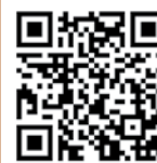
Standard Chartered 渣打銀行