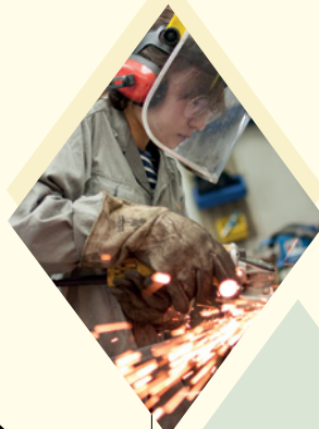
Theatre and Entertainment Arts 舞台及製作藝術