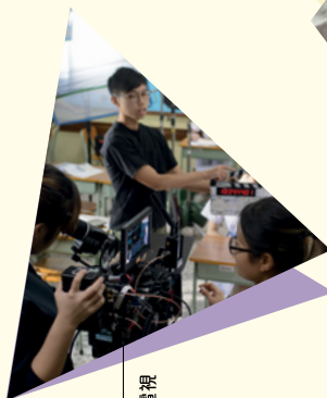
Film and Television 電影電視