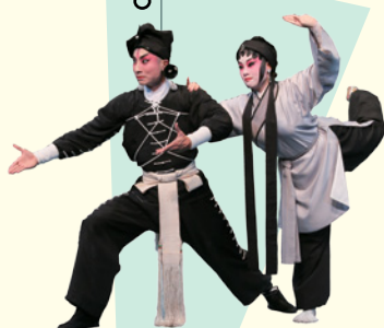
Chinese Opera 戲曲

INFORMATION DAY 課程資訊日 15/9/2018 (SAT 六) 10AM - 4PM