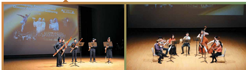
Academy students gave music performances to express their appreciation to the donors. 演藝學院學生以音樂表演向捐款人表示謝意。