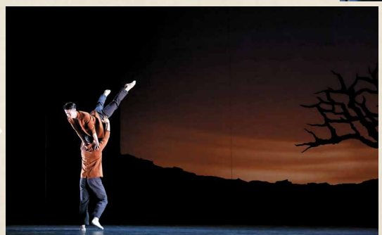
From left to right: Eternity Formed by Fragments 《Eternity Formed by Fragments》(Ballet 芭蕾舞), The Homeland 《鄉》(Chinese Dance 中國舞), Set and Reset/Reset 《Set and Reset/Reset》(Contemporary Dance 現代舞)

The Festival runs till early July. Some programmes offer free admission to public. For details, please visit: 演藝節舉行至7月上旬，部分節目免費入場。詳情請瀏覽網站: http://www.hkapa.edu/event/tch/AcademyFestival2018/