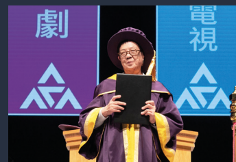
Dr. Ann Hui On-wah BBS MBE 許鞍華博士 BBS MBE