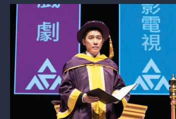
Dr. Tony Leung Chiu-wai 梁朝偉博士