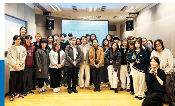
The School of Music regularly invites musicians from all over the world to engage in exchanges with its students. 演藝學院音樂學院經常邀請各地音樂家來港與學生交流。