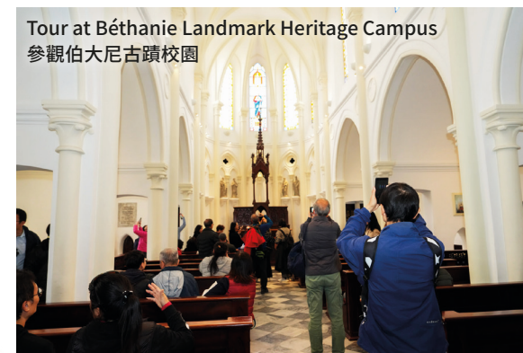
Tour at Béthanie Landmark Heritage Campus 參觀伯大尼古蹟校園

一年一度的演藝學院開放日又來了！適逢演藝學院慶祝創校四十周年，一連串表演藝術活動將於三月二日（星期日）為大家送上。請勿錯過開放日各項精彩的免費活動！