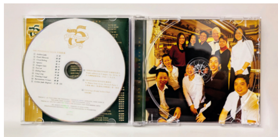
The Peninsula Hong Kong invited The Academy composition students to write ten pieces for the hotel's 75 th anniversary celebrations in 2003; these were subsequently compiled in a commemorative album. 二零零三年半島酒店邀請音樂學院作曲系學生為酒店七十五周年誌慶創作十首樂曲，並收錄於紀念唱片。

"I had two job offers at the time," she recalls. One