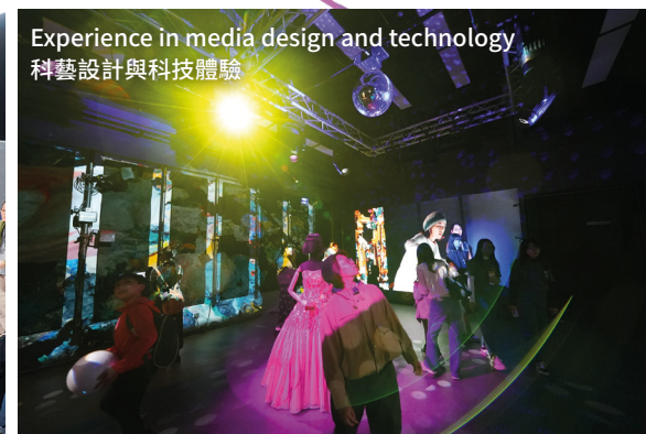
Experience in media design and technology 科藝設計與科技體驗