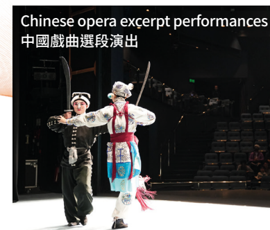
Chinese opera excerpt performances 中國戲曲選段演出