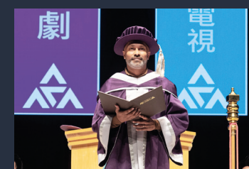
Mr. Akram Khan 艾甘·漢先生