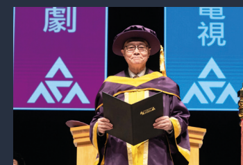
Prof. Yuen Siu-fai BBS BH 阮兆輝教授 BBS BH