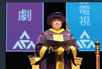
Mr. Sammo Hung Kam-po 洪金寶先生