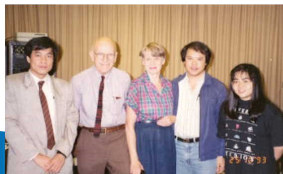
Prof. Max Mathews (2 nd left), father of computer music, was invited to the Academy to share with School of Music students in 1993. 「電腦音樂之父」Max Mathews教授（左二）於一九九三年受邀到演藝學院與音樂學院學生分享音樂。