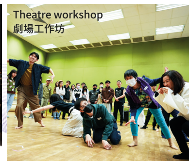
Theatre workshop 劇場工作坊