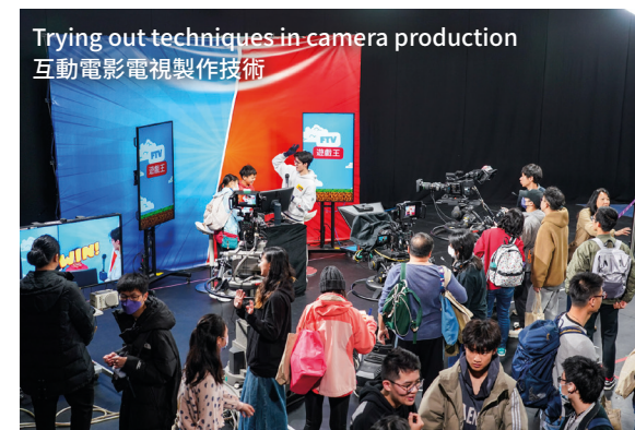
Trying out techniques in camera production 互動電影電視製作技術