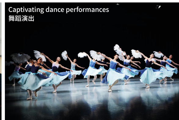
Captivating dance performances 舞蹈演出